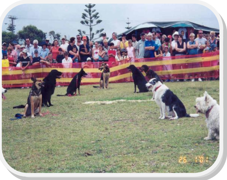
From the Archives - Club Demonstration at Australia Day Mollymook Beach—2001