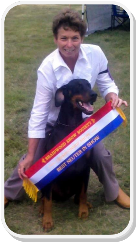
Congratulations Razor - best Neuter at the Braidwood Show in March, at his first Show Outing!