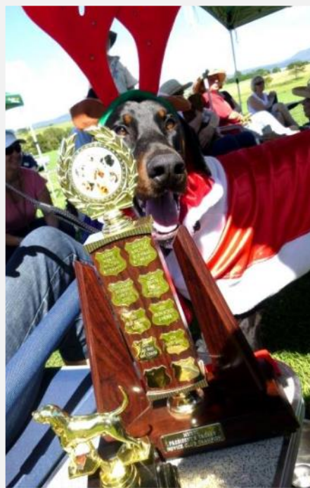
Razor winner Presidents Trophy - Club Novice