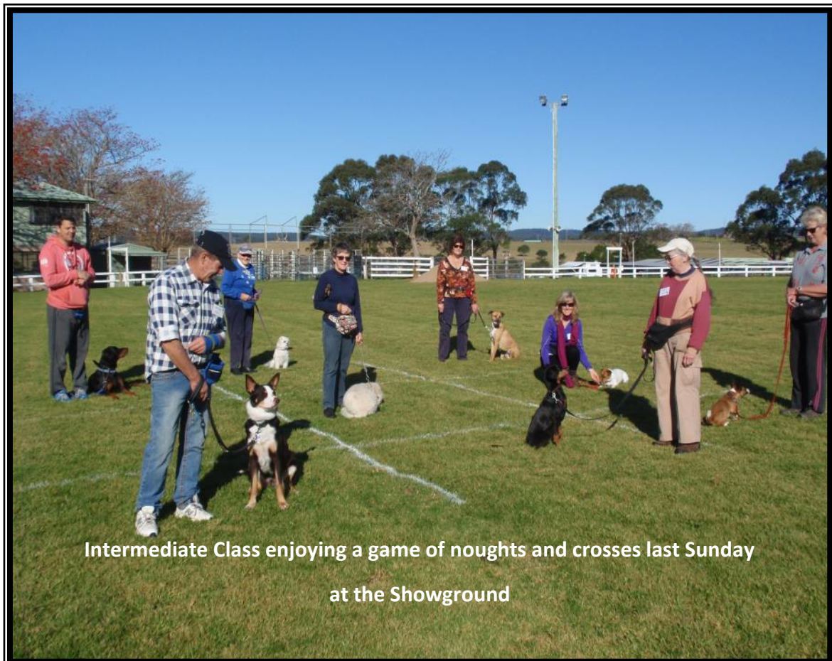
Intermediate Class enjoying a game of noughts and crosses last Sunday at the Showground