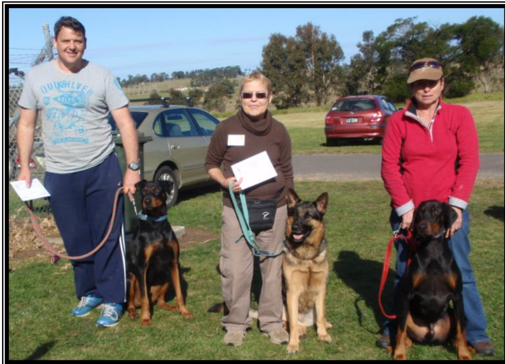
President's Cup Winners