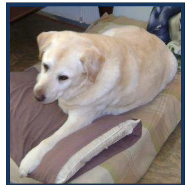
Happy Birthday Jimmy