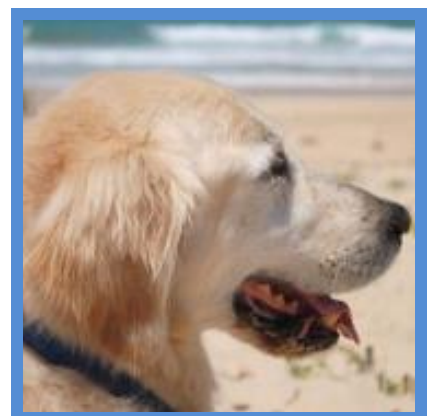
BJ at a favourite place – on the Beach

Please don't take your dog with you when you pay at the Clubhouse counter as it can get very congested.