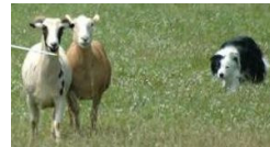
Border Collie at work

This month details the Working Group, which as the name implies are the dogs bred to do many different tasks. Some of the breeds included in the Working Group are listed here, and are well represented in our Club. Border Collie; Corgi; Shetland Sheepdog; Australian Kelpie; Australian Cattle Dog; Australian Shepherd; German Shepherd Dog; Old English Sheepdog; Maremma Sheepdog; Komondor; Bouvier Des Flandres. In general, kennel clubs assign larger breeds that are engaged in some sort of physically active work to their Working Group . In areas of the world where livestock production is economically important, such as Australia, pastoral dogs are placed in the Working Group .