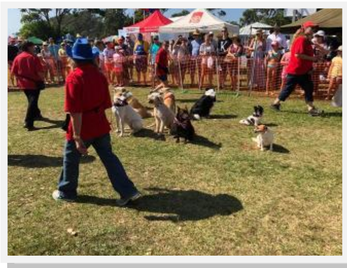
Part of the obedience routine to music