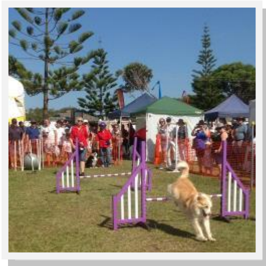
Shelby - retrieve exercise